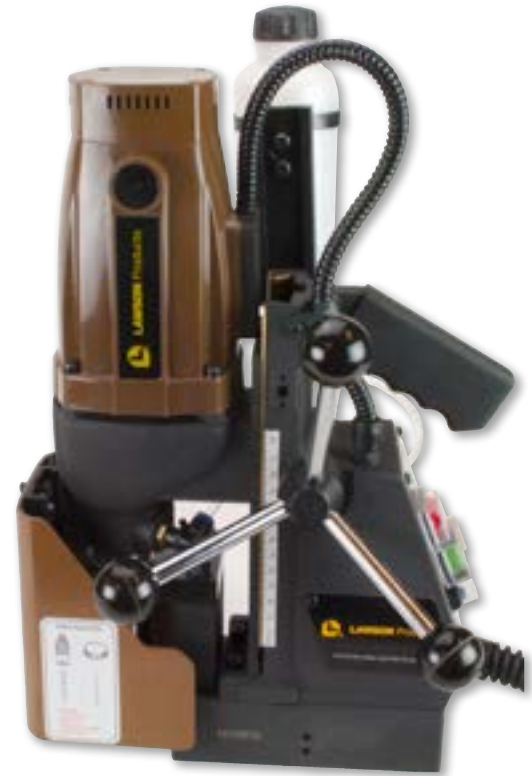
Item No. 1574562

Lawson's portable magnetic drill allows you to take the drill to your work piece. It can be used in vertical, horizontal or overhead positions.