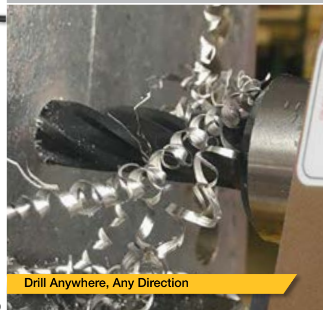
Drill Anywhere, Any Direction