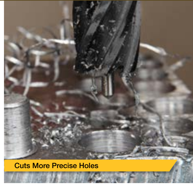
Cuts More Precise Holes