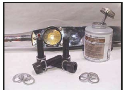
Fasteners, torque wrench, and anti-seize