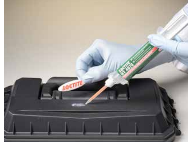
Precise Application With Non-Drip Formula Gel Product