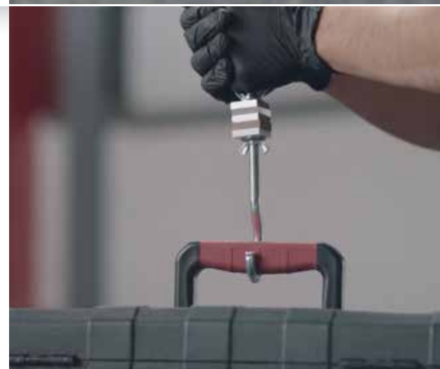
High Strength Bonding