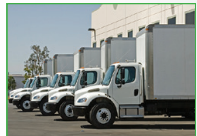
Fleet & Transportation