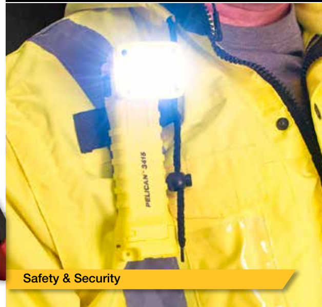
Safety & Security