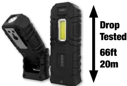
Drop Tested 66ft 20m